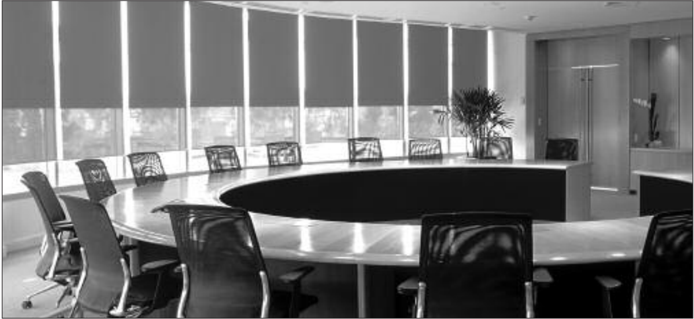
Bank Boston, Sao Paulo, Brazil SOM-Chicago – Architects