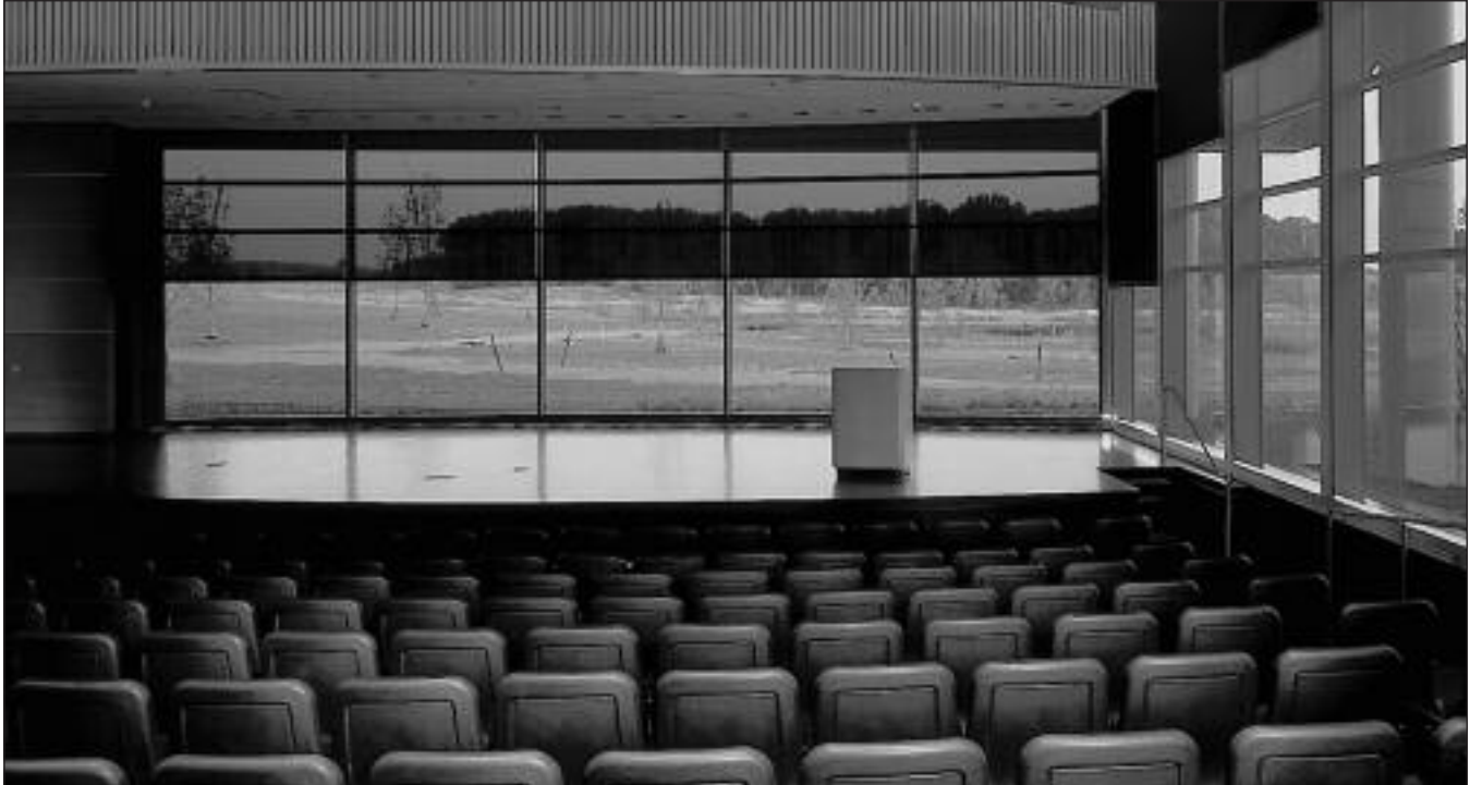
Motorola Cellular Subscriber Facility, IL Globetrotter's Engineering – Architects